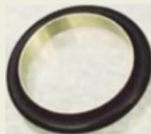
KF Type Centering-Rings